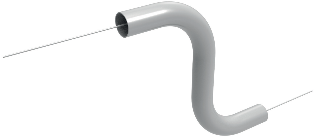
Figure 2. Duct cleaning

To remove material from narrow ducts, design and print a strip or a chain through the duct. When the part has been printed, the chain can be pulled out to dislodge most of the material. Any remaining material can be removed through the normal cleaning process.