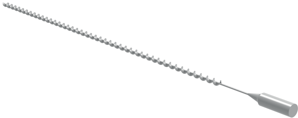
Figure 3. Flexible screw

For ducts narrower than 5 mm, clean the inside with a flexible screw once the part has been printed. To improve the flexible screw cleaning performance, it can be attached to a drill.